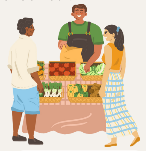
Use your benefits by Nov. 30th.!

Enjoy the same great FARM FRESH FRUITS, VEGETABLES, AND HERBS without the paper checks. No signature, no hassle.