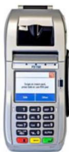
First Data 150 (FD150)