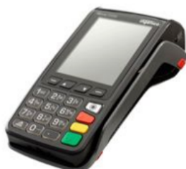
Ingenico Desk 3500