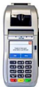
First Data 150 (FD150)