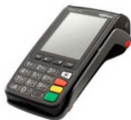
Ingenico Desk 3500